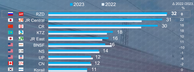
Traffic density, m adjusted tkm/km